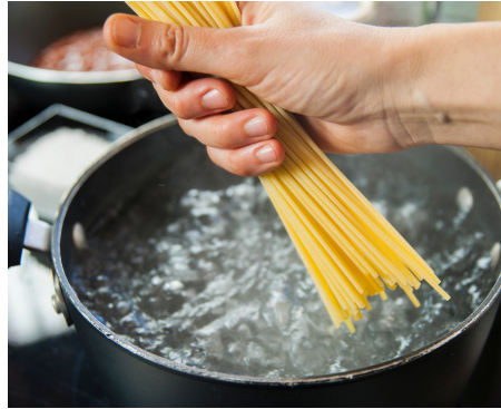
pot on stove